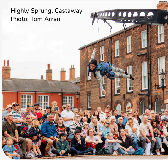
Highly Sprung, Castaway

We will continue to produce our festival with sustainability at the core, and currently work in partnership with Without Walls, Northern Festival Network, Urban Sustainable Arts Network (USAN) and Global Streets to share learning, data and best practice and to ensure we are doing everything we can with our artists and audience to reduce our carbon footprint.