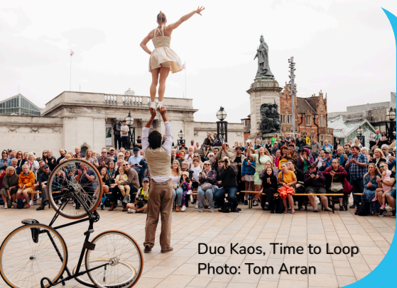
Duo Kaos, Time to Loop