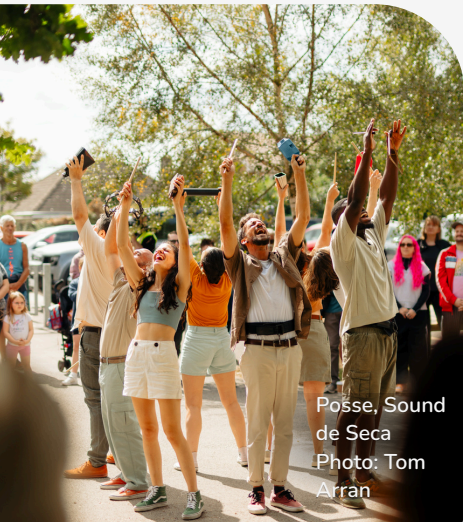
Posse, Sound de Seca

Hull Freedom Chorus Hull Samba NAPA VIPS State of the Arts Welcome to English