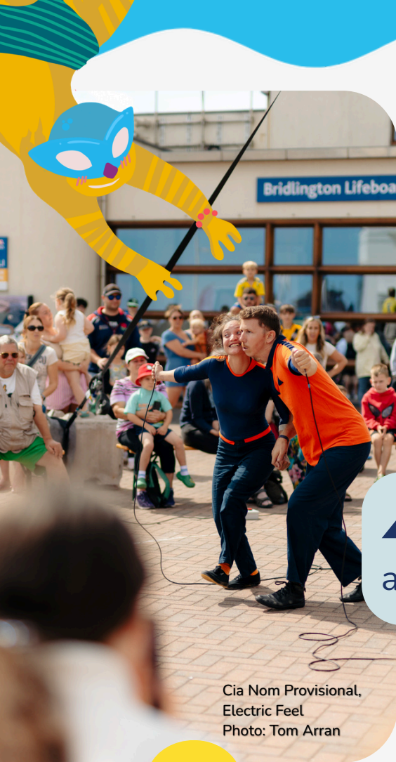
Cia Nom Provisional, Electric Feel

97% Rated Freedom on Tour as good and very good