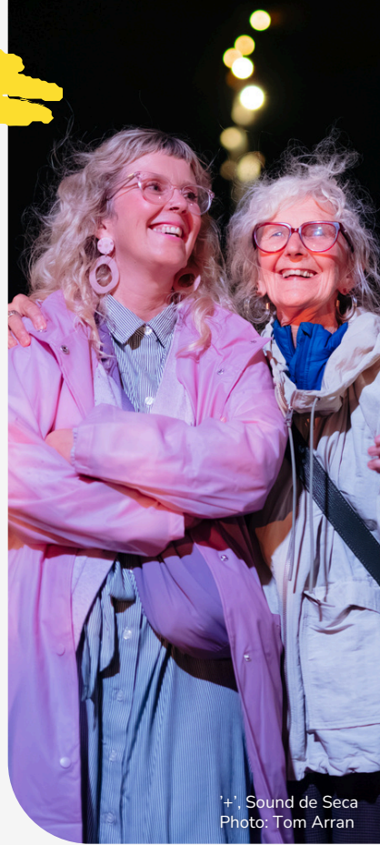
‘+’, Sound de Seca

We believe that the people of Hull deserve to see the best and there are so many beautiful and powerful pieces of art and creativity from around the world that should come to Hull. Many artists through networks we are a part of, so when we can bring something new and innovative to our streets, we will!