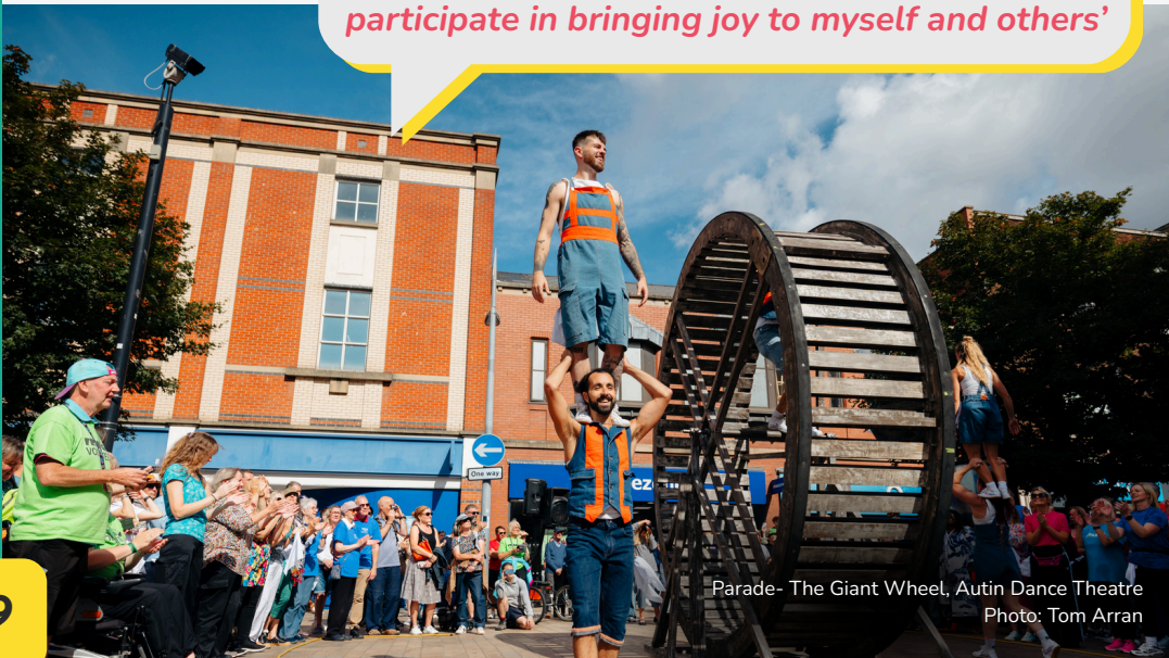
Parade- The Giant Wheel, Autin Dance Theatre

'How grateful I am for the chance it gave me to participate in bringing joy to myself and others'