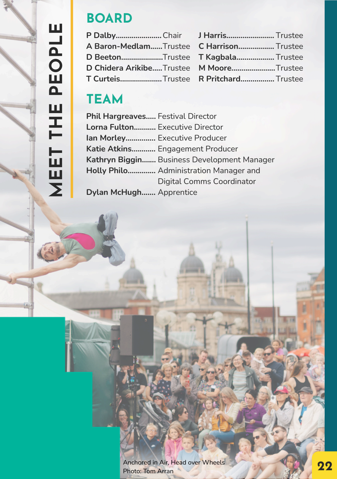
Anchored in Air, Head over Wheels