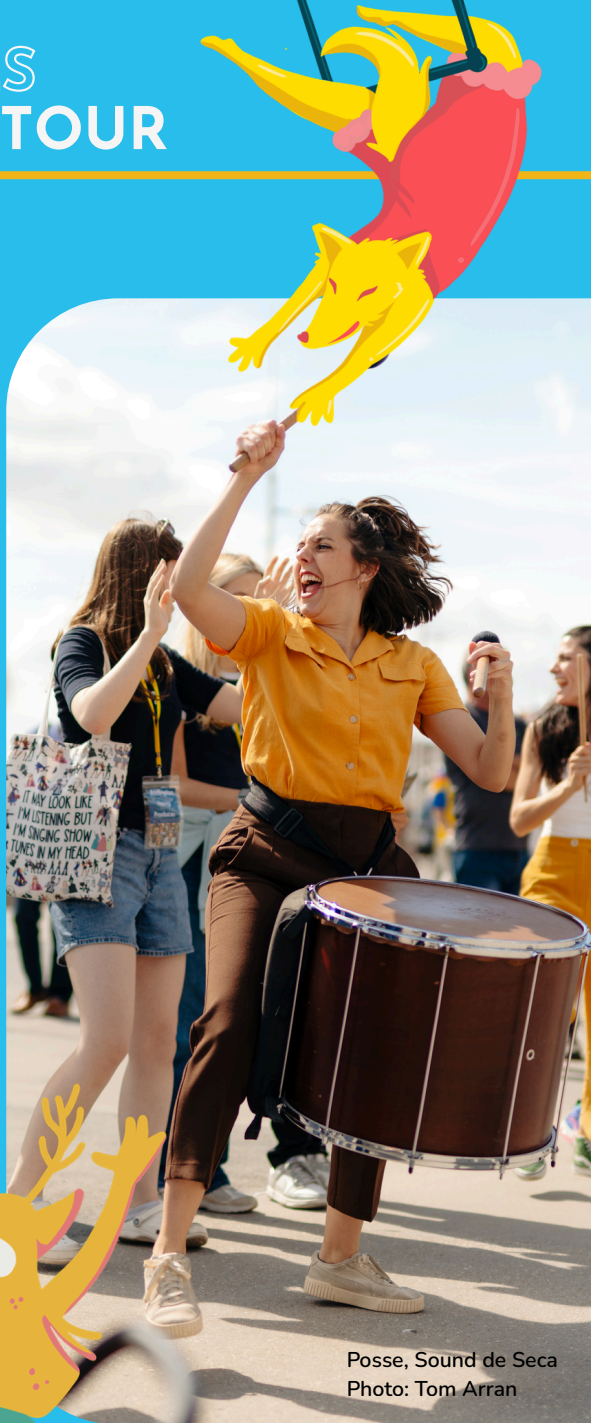
Posse, Sound de Seca

Freedom on Tour is a new international touring initiative led by Freedom Festival Arts Trust (FFAT) established to support the presentation of high-quality outdoor arts across public spaces in East Riding, Yorkshire & Lincolnshire. Working as a new consortium our partners include Culture House & North East Lincolnshire Council, ARCADE and The Barn in Tadcaster, Bridlington Council & Goole Junction. In August 2025, Freedom on Tour visited Goole, Cleethorpes, Bridlington Spa, Tadcaster and Hull, and will visit again in 2026. The programme will provide more people with access to world class culture & build skills, capacity & ambition in the region.