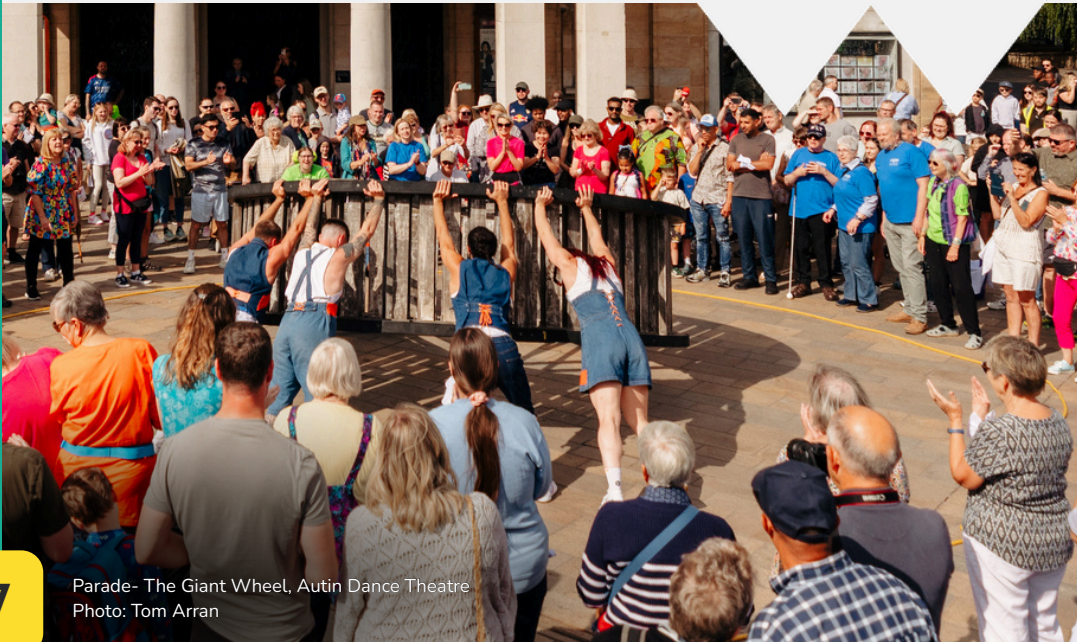
Parade- The Giant Wheel, Autin Dance Theatre

Parade -The Giant Wheel - a collaboration between Autin Dance Theatre, Freedom Festival and the people of Hull. Who create a beautiful and impactful parade from Queen Victoria Square to the Cenotaph. Communities from the across the city from all lived experiences came together to dance, be joyous and have fun in our streets - celebrating our differences and highlighting when we all work together, great things happen!