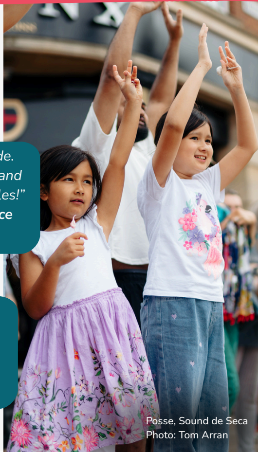
Posse, Sound de Seca

"The jewel in the city's calendar - incredible companies from round the world, free and accessible for all" - Freedom Festival audience member