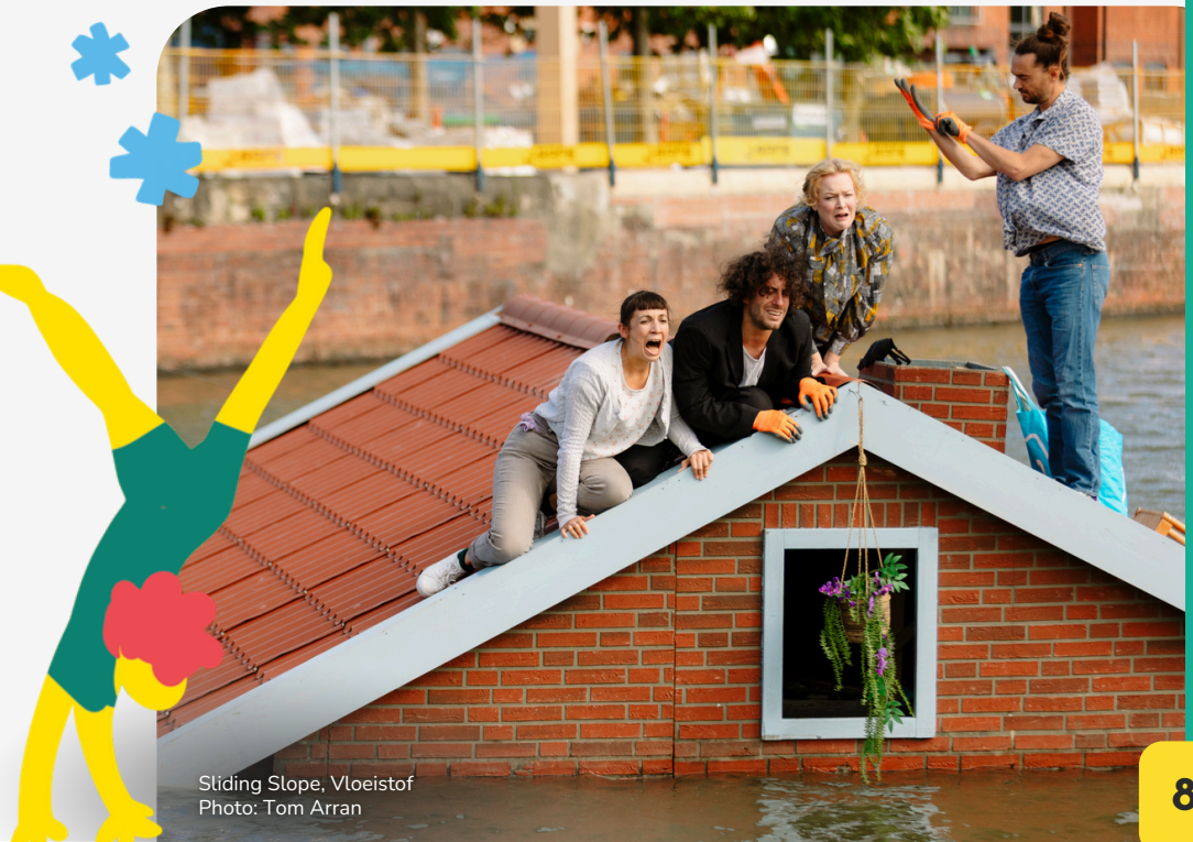
Sliding Slope, Vloeistof

The festival was a resounding success, reaching over 60,000 audience members, 250 participants, 148 performances from artists from 9 countries, and over 500 volunteer hours.