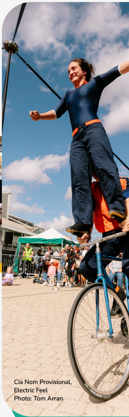
Cia Nom Provisional, Electric Feel