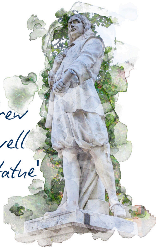
'Andrew Marvell Statue'